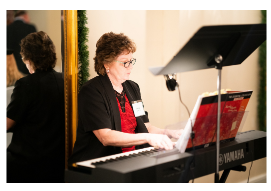
here to see photos from the event.