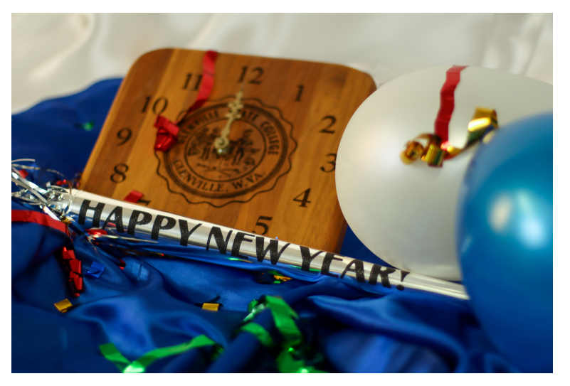
Wishing you joy and prosperity in 2024!