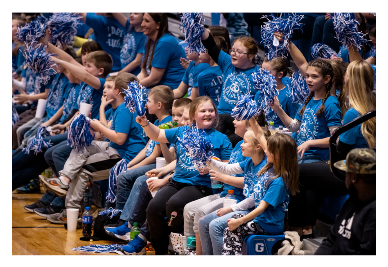
Students from Smithville Elementary School cheer on the Pioneers at "Kids Day."