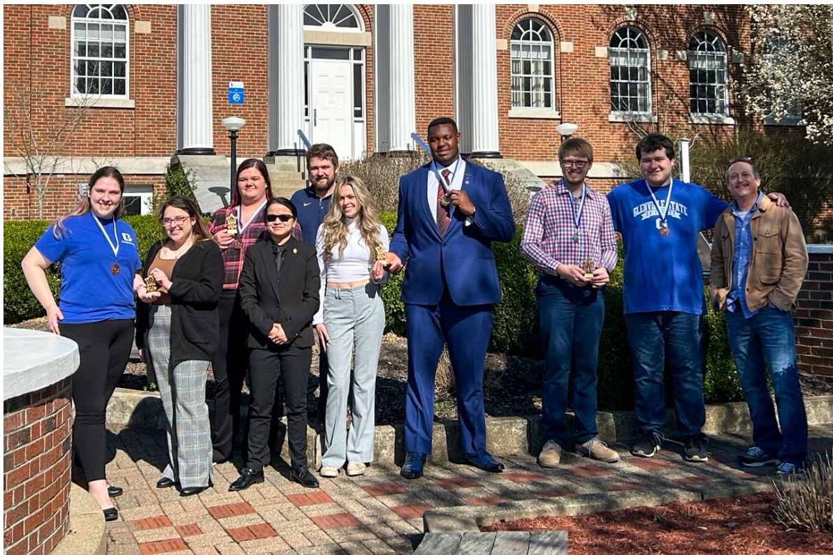
Members of the Pioneer Debate Team following last month's debate tournament that was held on campus.