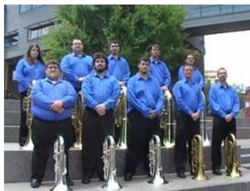
GSC Tuba and Euphonium Ensemble