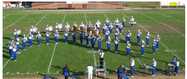
GSC “Wall of Sound” Marching Band performing at the 2008 Forest Festival Annual “Spectacle of Bands” as the Featured Exhibition Band in Elkins

The Glenville State College Pioneer Marching Band was chosen to be the featured college band at the 72nd Annual Mountain State Forest Festival parade on Saturday, October 4, 2008. In previous years, the WVU Marching Band, the Marshall University Marching Band, and the Shepherd University Marching Band have served as the lead bands for the parade.