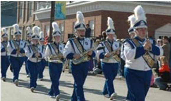
GSC Marching Band in 2008 Homecoming Parade