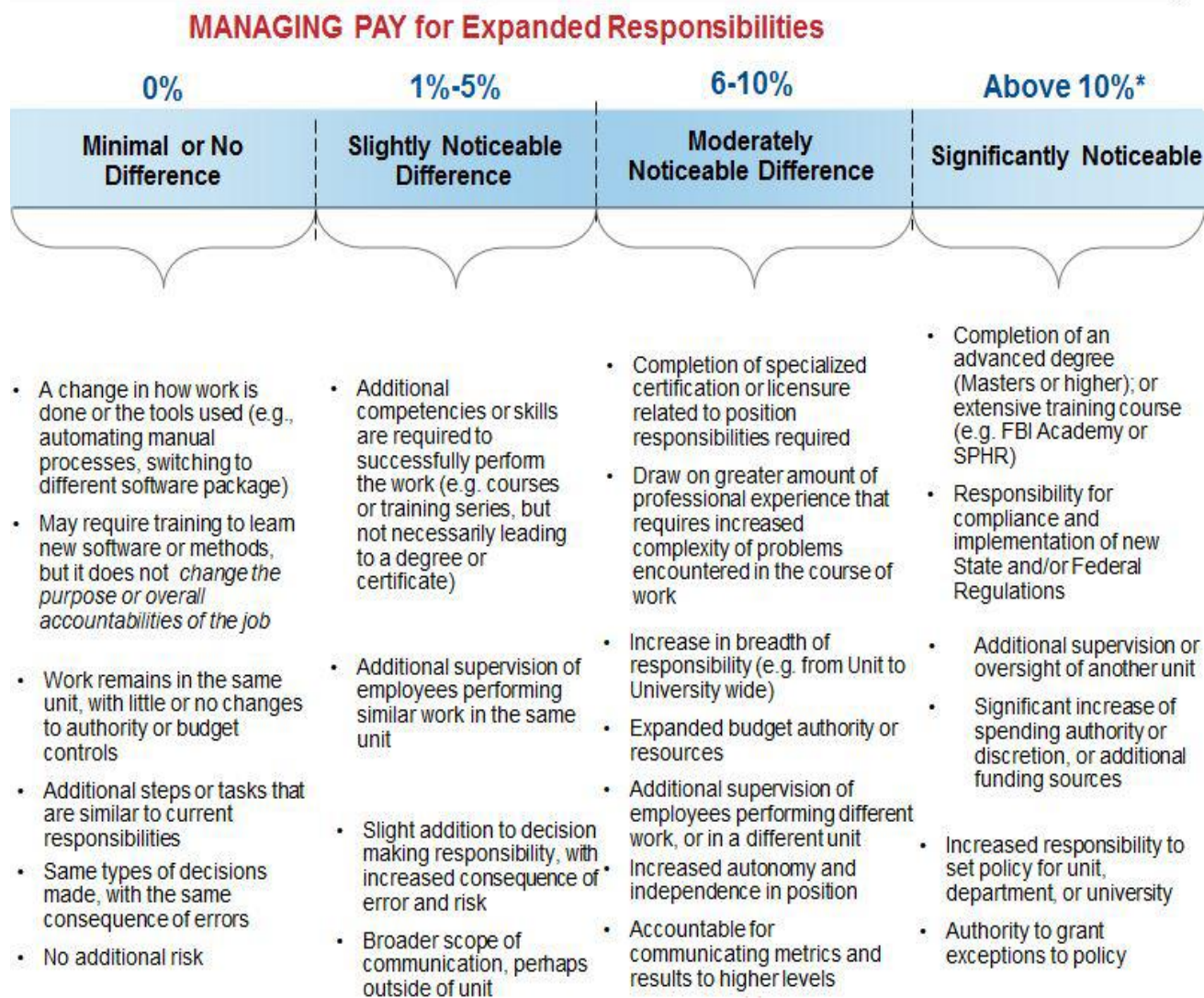
Graphic 2: Managing Pay for Expanded Responsibilities

*Salaries should not be increased outside of the range associated with the identified position classification