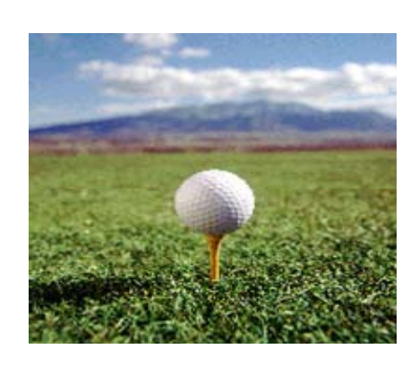
May 8, 2009