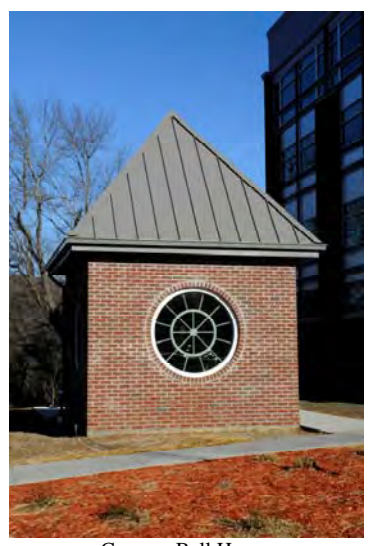
Campus Bell House

On Tuesday, July 20, 2010 the bell in the College's clock tower was removed for preservation. The iconic bell had rung for decades but had been silent for the past several years since the hourly chime started coming from speakers controlled by a computer system in the clock tower.