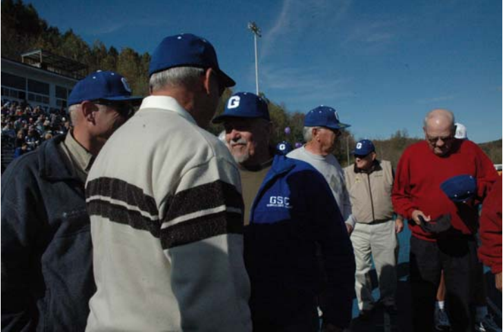
Former baseball players as they were leaving the track after halftime recognition