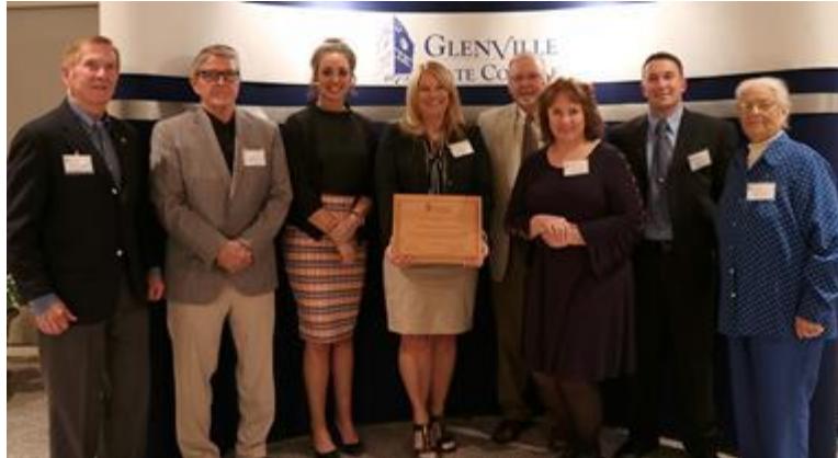
2018 Alumni Awards Recipients