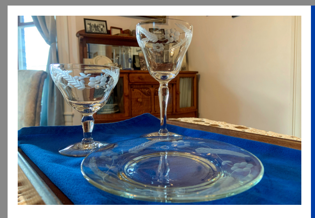
Pieces of Ludwik glass on display inside the GSU Alumni Center.

or call (304) 462-6382 to learn more about membership benefits and how to enroll.