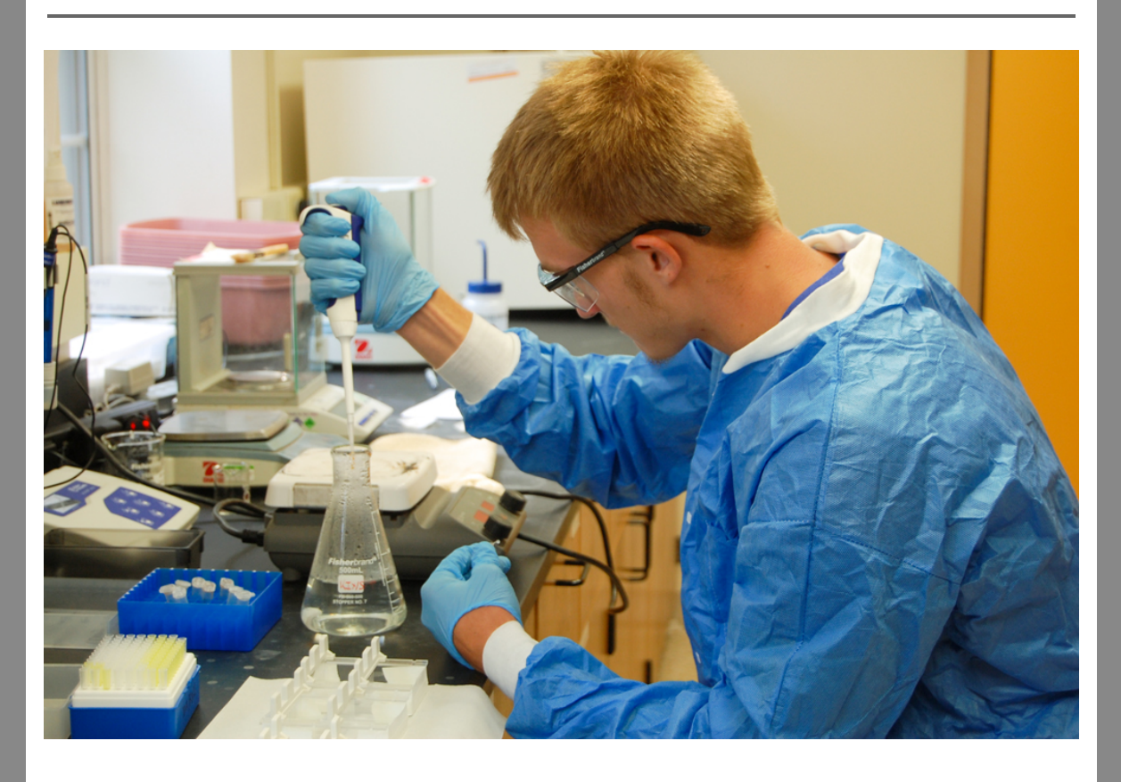
A HSTA camper analyzes evidence in one of the Science Hall labs.

becomes the 84th student to portray the Pioneer Mascot. She will be the eighth woman to serve as the Pioneer.