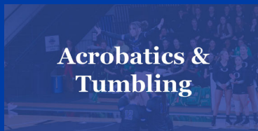
Acrobatics & Tumbling