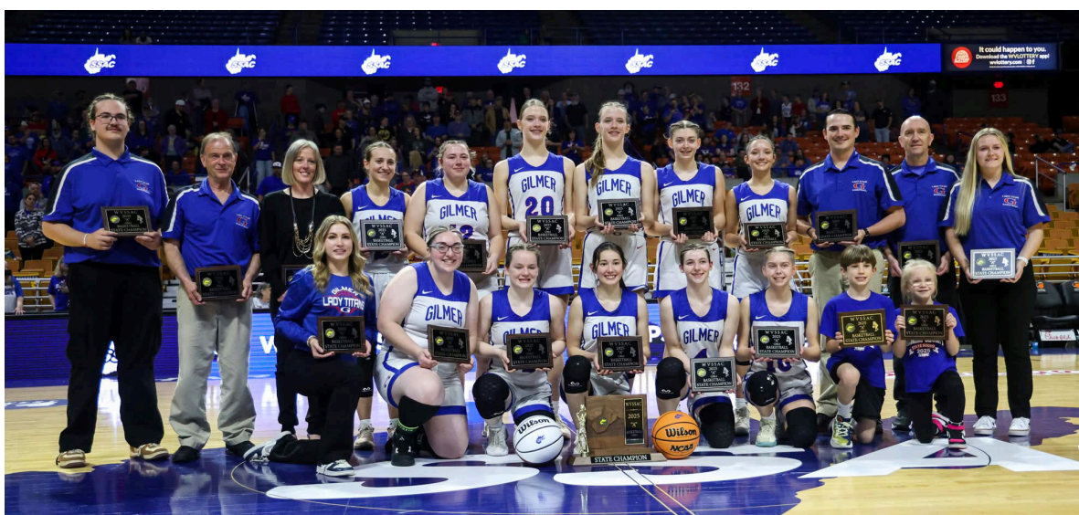
Gilmer County Girls Basketball team

Glenville State alumni may also browse the Alumni Career Services resources for additional information.