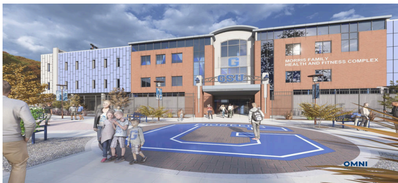
Artist's rendering of the proposed Morris Family Health and Fitness Complex at Glenville State University.