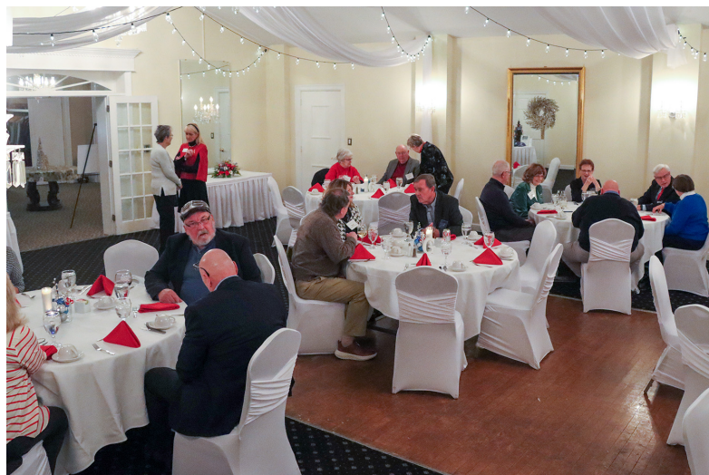
Glenville State alumni and friends chat and reminisce at last year's Mid-Ohio Valley Alumni Chapter Christmas Dinner.