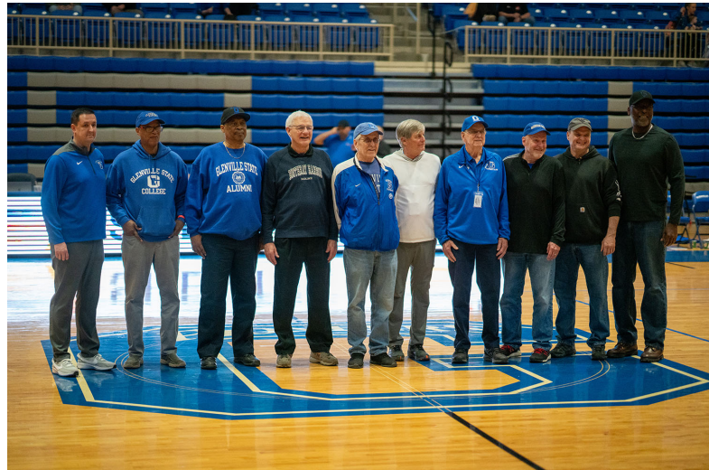
Past men's basketball players and coaches being recognized at Winter Homecoming in 2024.

The Professor of the Year award is sponsored by individual donors and United Bank, Bowles Rice LLP, Greene, Ketchum, Bailey & Tweel LLP, Maier Foundation, and The Daywood Foundation, Inc.