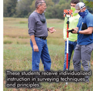
These students receive individualized instruction in surveying techniques and principles.

WV NEWS Business Profiles are sponsored content. Contact 304-626-1426 or email jmiller@theet.com to learn how your business can be featured.