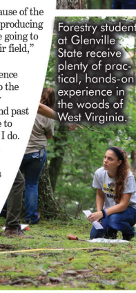
Forestry students at Glenville State receive plenty of practical, hands-on experience in the woods of West Virginia.