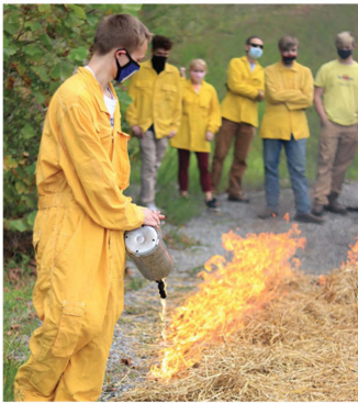
Glenville State students learn how to use a controlled burn for environmental purposes.