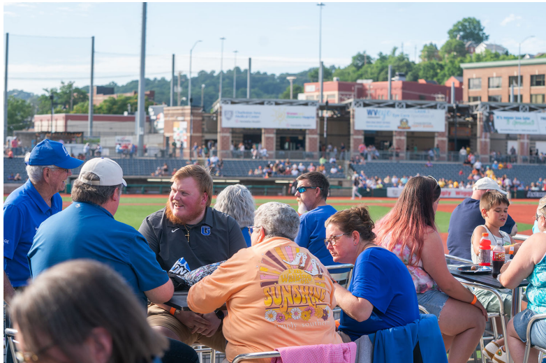
Alumni and friends enjoying the party deck at a previous GSU Night at GoMart Park.

We are pleased to feature Cole in this month's Alumni Spotlight and are proud to call him an alumnus.