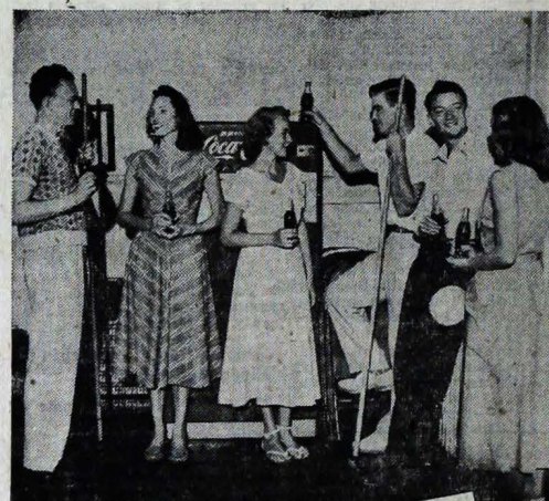
Rebel Grill University, Mississippi (Oxford)