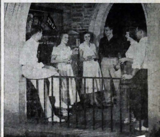
"Y" Duke University Durham, North Carolina

Member Federal Deposit Insurance Company