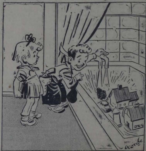
"What a dandy place to have floods!"