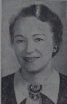
IVY BAKER PRIEST