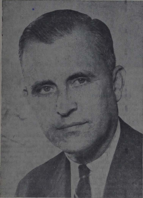
GOVERNOR W. W. BARRON