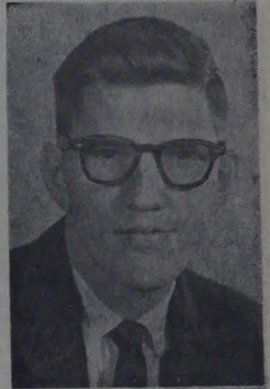
DR. EVERETT ROGERS