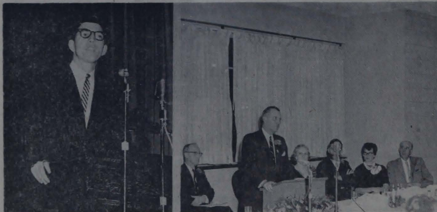
SIXTH ANNUAL Educational Development Conference was held on the Glenville State campus April 11. Adults, as well as high school and college students, from the central West Virginia area and other areas in the state