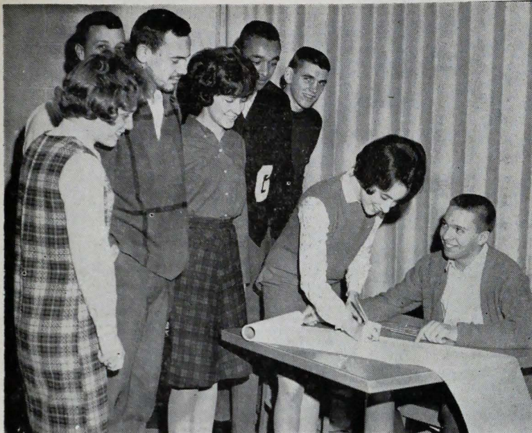
Students gather in the union to sign a petition in protest against the West Virginia three per cent tax on food and drugs.