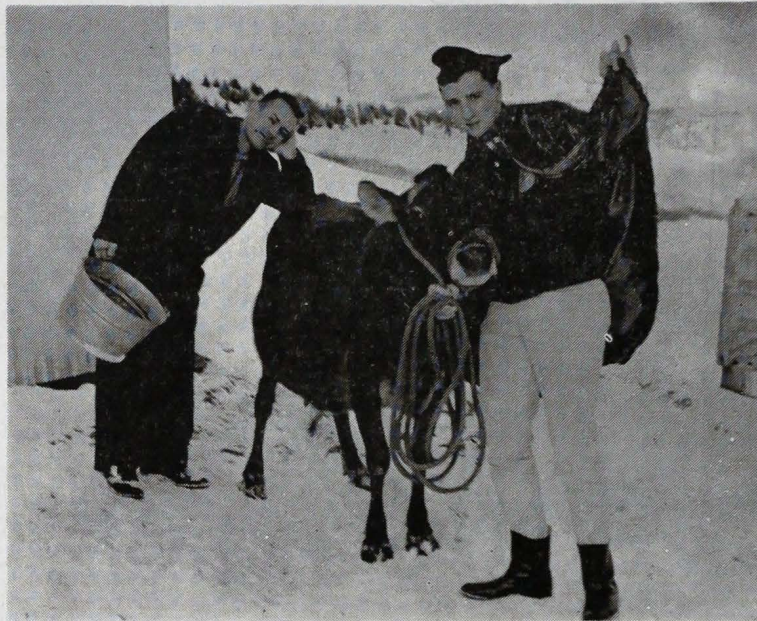
The collegiate approach to the farm problem.