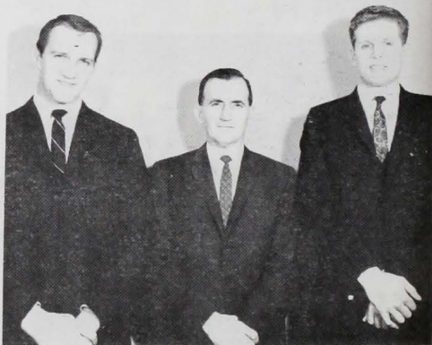
Theta Xi Advisors

Each of the pledges has two big sorority sisters. Those sisters help them get acquainted with the sorority and sorority life. The pledges are to make a star out of plywood and get the names of all the members and pledges on it for one big sister. This is due in the near future. For the other sister, a pillow is to be constructed at a later date.