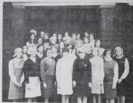
Delta Zeta Pledges