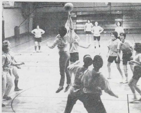
It's a jump ball during the Town Girls vs. Mapel Nuts WAA action as basketball season begins for the women.