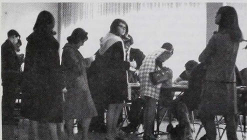
Some of the ado and confusion of registration registered in the above photo taken last week.