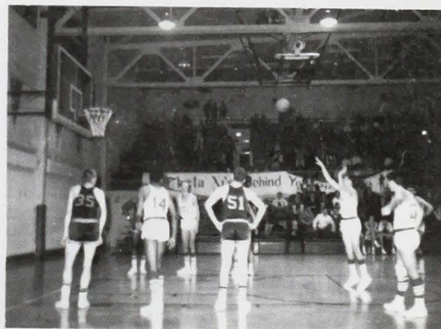
Action shot from the Glenville-Morris Harvey game