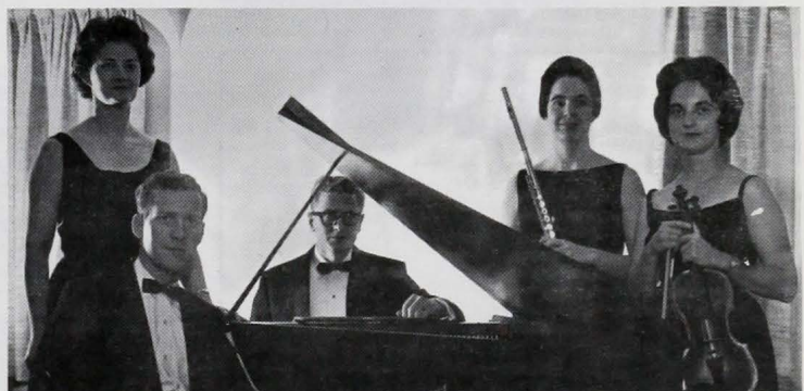
WVU Baroque Ensemble

All college students and church members are invited to attend all sessions.