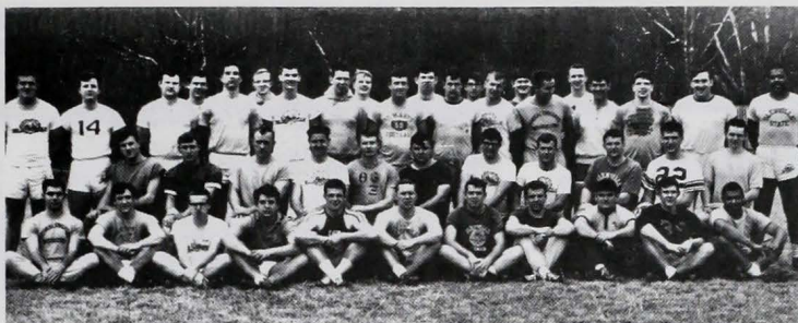
GSC Track Team