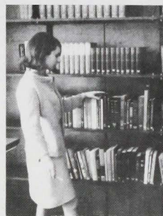
Library boasts new display shelf.