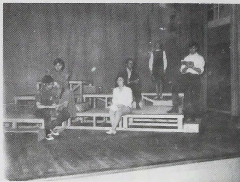
Students rehearsing for Spoon River .