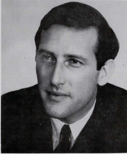
John D. Rockefeller

The pageant was the first of a yearly event to be presented by the Gilmer County Jaycees. The local winner will compete in the Miss West Virginia Contest to be held in Charleston.