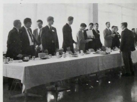
Theta Xi's meet.

The GSC Parking Committee recently released a bulletin to clarify the hours in which motor vehicles regulations are enforced. The parking regulation will be enforced between 7:30 a.m. and 4:30 p.m. Monday through Friday.