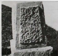
Base stone for a sundial to be placed at the top of the amphitheater.