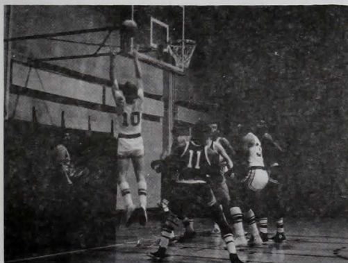
Action shot during the Concord-GSC game.