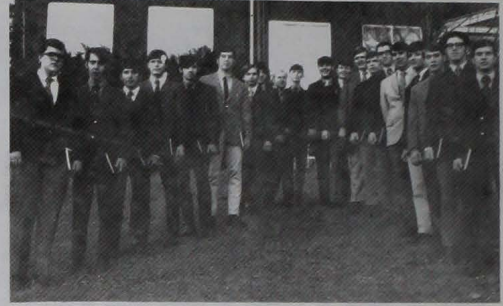
Lambda Chi's 20 associate members are pictured above with pledge manuals in hand. This is the fraternity's largest pledge class in its short history on campus.

A door to door drive was held this past Saturday throughout the Glenville community. More donations are badly needed. Collection depots have been established in the union, Louis Bennett Hall, Women's Hall, Verona Maple Hall, the Ben Franklin, and Kanawha Union Bank. A door to door drive will be held in the dormitories tomorrow night so the brothers of TKE ask that anyone having any donations have them prepared for collection.