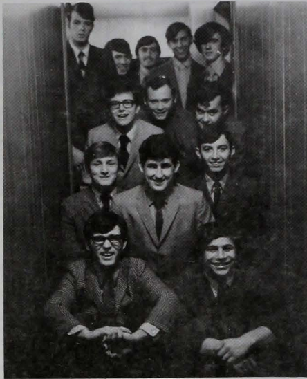
Theta Xi's 13 pledges are shown above as they begin fraternity life at the Theta Xi House in Camden Flats.