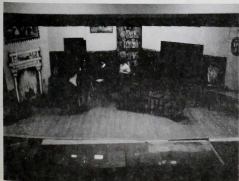
A rehearsal scene from "She Stoops to Conquer" which will open tonight.