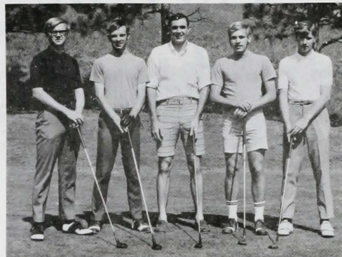
GSC Golf Team

Glenville State will participate in the state conference match this Thursday and Friday at Oglebay Park. The winner will advance to the regionals for further competition.