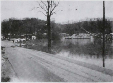
High water at the lower end of town last Friday was reminiscent of the 1967 Spring Flood.