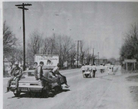
Tekes clean up with their bathtub.