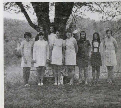
Ladies of the White Rose

Much time is now being spent on the annual Mother's Day Sing. As of yet all of the fraternity, sorority, and independent themes have not been received.