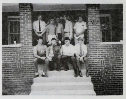
Tau Kappa Epsilon and Alpha Sigma Alpha won top honors of Greek Week. Tekes are shown above with their newly won trophies.