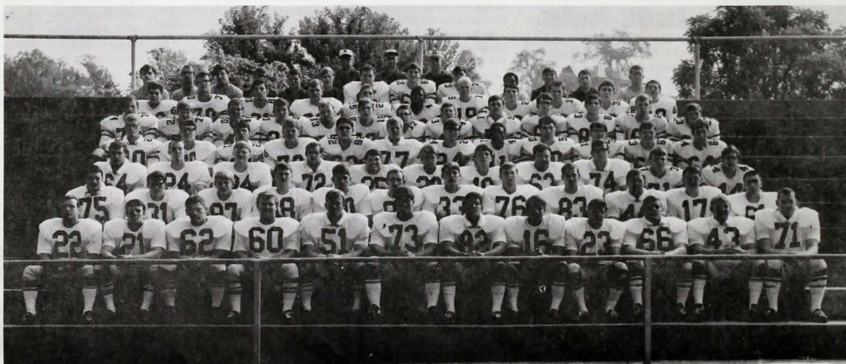
1970 Glenville State Football Pioneers