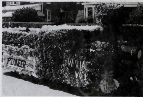
"The Pioneer Express," constructed by the members of Delta Zeta sorority placed third in the float competition.

This evening at 8:00 p.m. in the auditorium the Student Congress will present The Committee, a filmed collection of improvisational sketches commenting on every contemporary controversy. There will be a required donation of fifty cents.