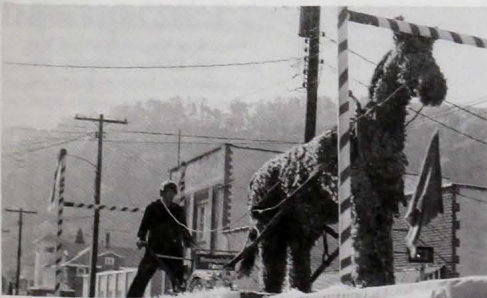
First place float in the Homecoming Parade was constructed by Tau Kappa Epsilon fraternity. Theme of the float was "Plow Bluefield Under."