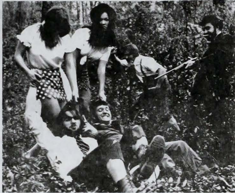
Preview of the Sadie Hawkins' fun coming this weekend.

GSC's representative will be chosen on the basis of performance, poise, ability and overall appearance.