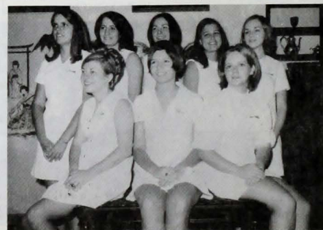
Pledges of Delta Zeta.

As a service in The Philanthropies endeavor, Delta Zetas are now collecting Clark gum packages. The Phillip-Morris Company will reimburse each package with milk, medical supplies, and educational facilities for underprivileged overseas nations.