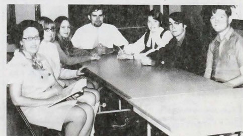
Campus Christian Coalition announces its newly-elected officers.