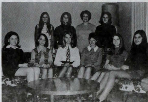
Pledges of Sigma Sigma Sigma.