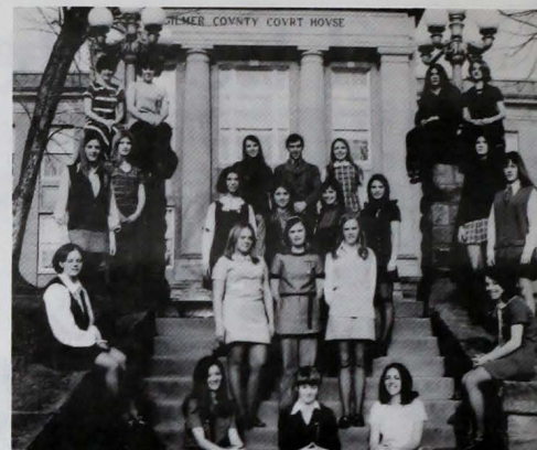
Pictured above are the charter members and pledges of the newly formed Theta Girls, women's auxiliary to Theta Xi.