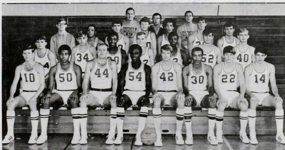
The 1971 Glenville State College Pioneer basketball team.