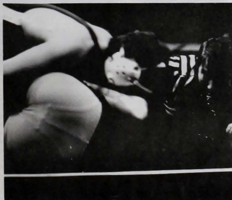
Who's the wrestler and who's the referee?

Tickets for Neil Diamond are priced at $6 and $5 and are on sale now at the Civic Center, Sears, Turners, Gorbys, Silver Brand Clothes, Arlans, and Kay Jewelers in Huntington. Reservations can be made by calling 344-2451. Neil Diamond is being brought to Charleston by the Lashinsky Brothers.