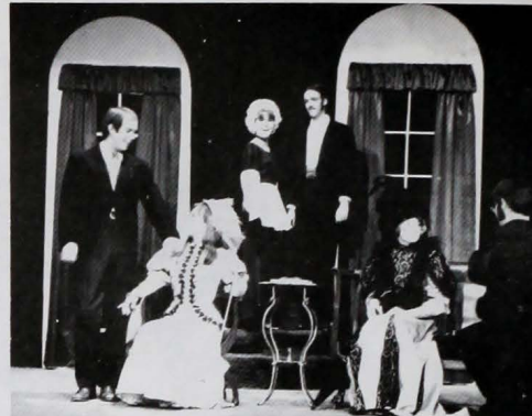
GSC's actors and actresses are pictured as they were rehearsing for tonight's presentation of "The Importance of Being Ernest."

There is a new club opening in Marietta known as the VIII (Veterans for the war for peace). It's a strictly farout college crowd. They have bands on Friday and Saturday.