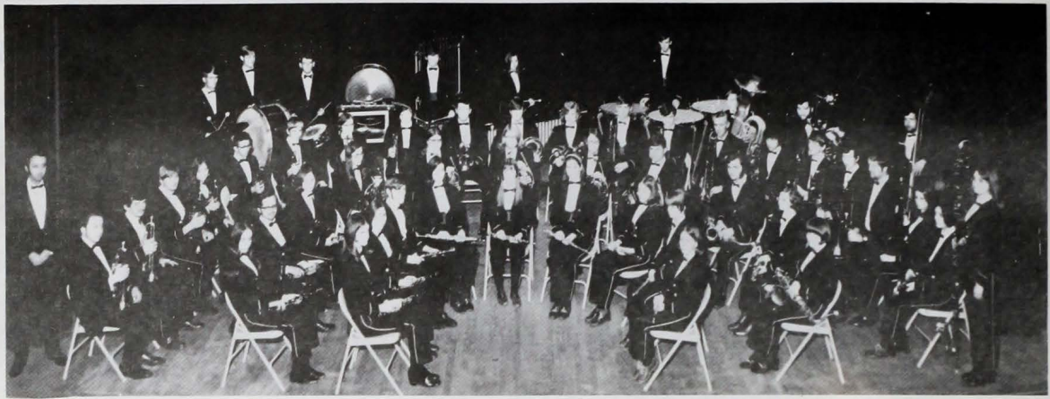
Pictured above is the Glenville State College Concert Band which left for its tour this morning.