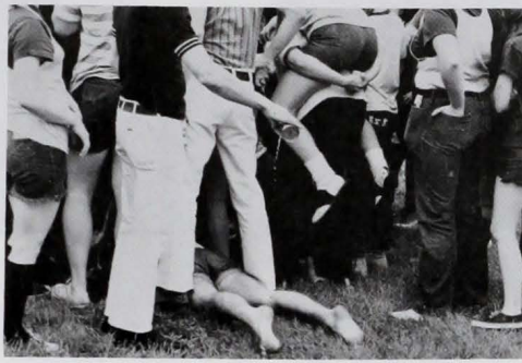
While several Greeks observed arm wrestling at Greek Week activities Saturday, one spectator seems to be harrasing a competitor.

Awards were presented at the dance. Theta Xi fraternity won the men's activity competition and Delta Zeta sorority won the women's. A new award for the group having the most Greek Spirit was awarded to Alpha Sigma Alpha sorority.