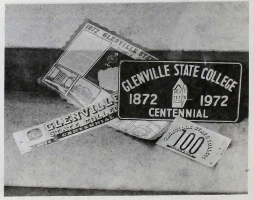
These emblems of the GSC Centennial can be purchased in the College

A sample of the GSC centennial ring can also be seen and orders for the ring are now being taken.