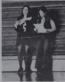
Here are two lone cheerers at the enthusiasm-packed pep rally Jan. 18.