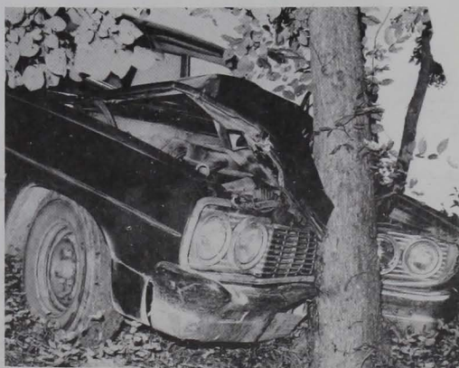
A freshman's first lesson at Glenville State might prove to be that of using a brake on hills. This car was parked, but, unfortunately, ran over a hill.