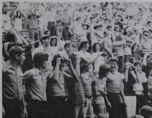
Freshmen are shown in a jovial mood at their traditional capping ceremony.