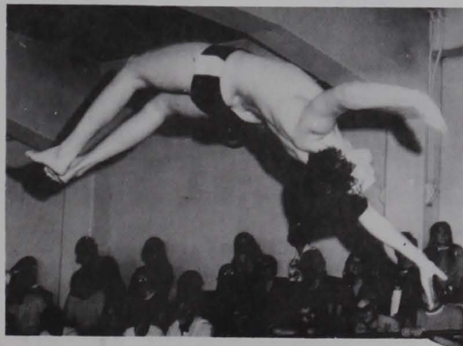
Pioneer diver competing in last week's swim meet at Berea College of Kentucky. The Pioneers' swimmers defeated Berea in a close match 57-56.