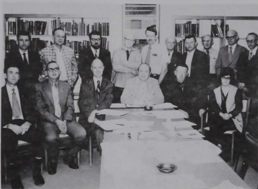
Shown above are members of Board of Directors of the W. Va. Association of Land Surveyors that held their quarterly meeting at GSC.

The request for a fee increase and the subsequent referendum should clearly represent the students' desires of more and better entertainment. The change in fee would increase both quality and quantity of current