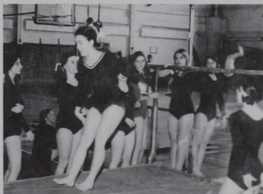
Performing on the uneven parallel bars are members of Parkersburg South gymnastics squad.