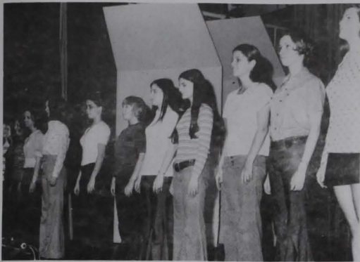
Some candidates for Miss GSC rehearse a dance number on the stage of the auditorium. The pageant was held at 8 p.m. last night. Pictures of the 1973 Miss GSC will appear next week.