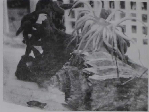
A hermit crab and a sea anemone are shown in their new home, the science department's new aquarium.