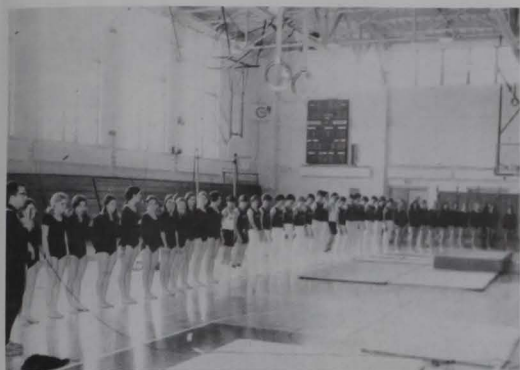
Pictured above are the members of the Parkersburg South gymnastics team which performed here last Tuesday.