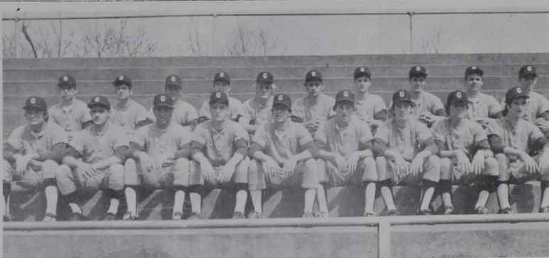
THE 1973 GLENVILLE STATE COLLEGE BASEBALL TEAM