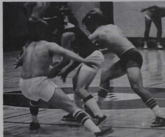
Intramural action began again this week. Over thirty teams are participating in four different flights.