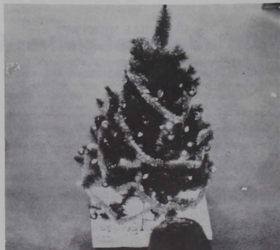
"Signs of Christmas" Shown above is the Christmas tree which stands in the Robert F. Kidd Library.