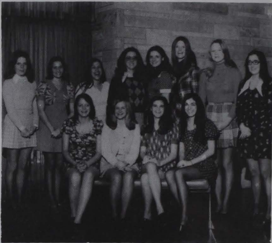
The spring pledge class of Sigma Sigma Sigma.