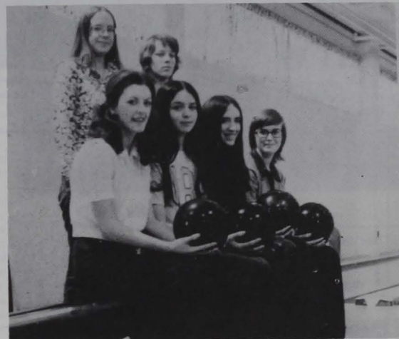
The 1974 Glenville State College Women's Bowling Team.