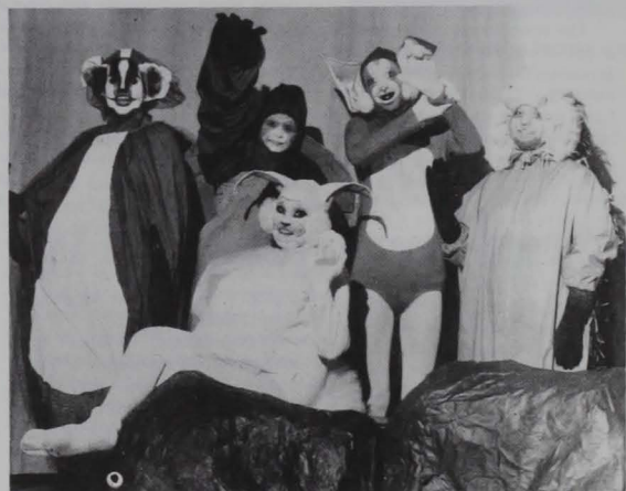
These animated characters are some members of the cast for THE GREAT CROSS COUNTRY RACE. Reservations are now available in the drama department or at the Campus Information Center.

The repertoire of the Piedmont Chamber Orchestra embraces the legacy of instrumental music of the seventeenth and eighteenth centuries as well as an increasing number of twentieth century compositions devoted to the singular beauty and flexibility of the small orchestra.