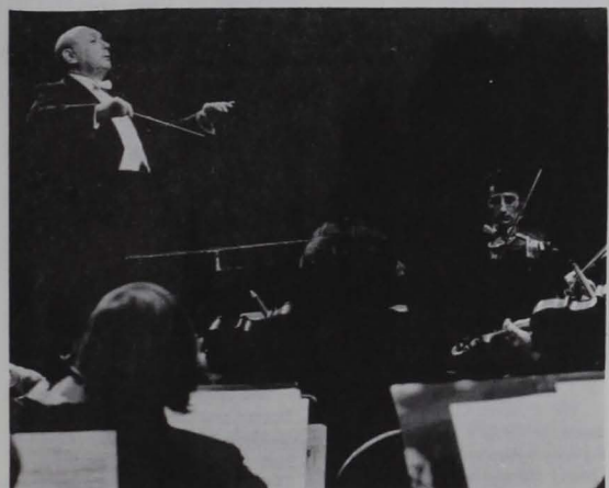
The Piedmont Chamber Players from the North Carolina School of the Arts in Winston-Salem, North Carolina, will perform here on April 5 at 8:00 p.m.