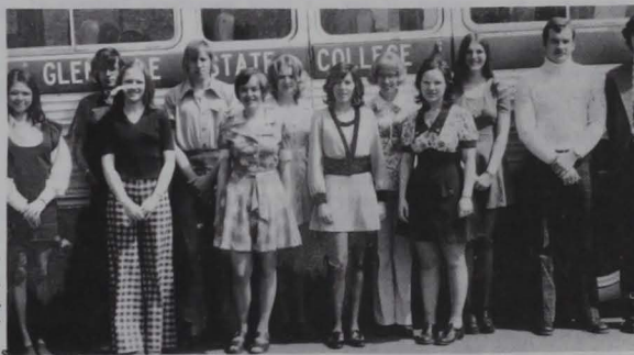
Pictured above are twelve students in the Division of Business at Glenville State College who participated in the college's first student exchange program last week.

Gettysburg College and Cornell University. Preceding his employment at Glenville State College, he taught in Pennsylvania and New Jersey schools. He became professor of mathematics and physics at Glenville State College from 1920 until 1957 when he retired. Following his retirement he taught at Pensacola Jr. College from 1957-1962 and substituted at Glenville and Calhoun Co. High Schools after 1962.