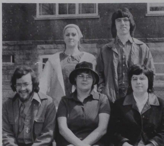
Pictured is the Glenville State College National Forensics Team which placed fifteenth in the nation at the National finals in New York last week.