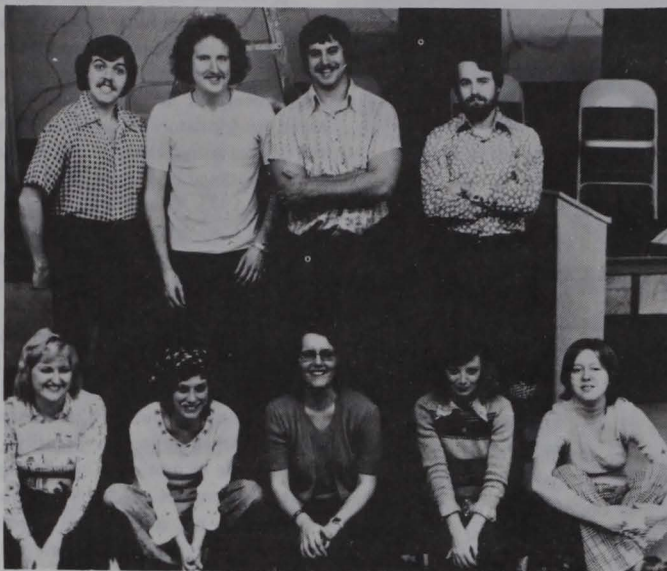
Members of the play cast chosen for All My Sons is pictured above.