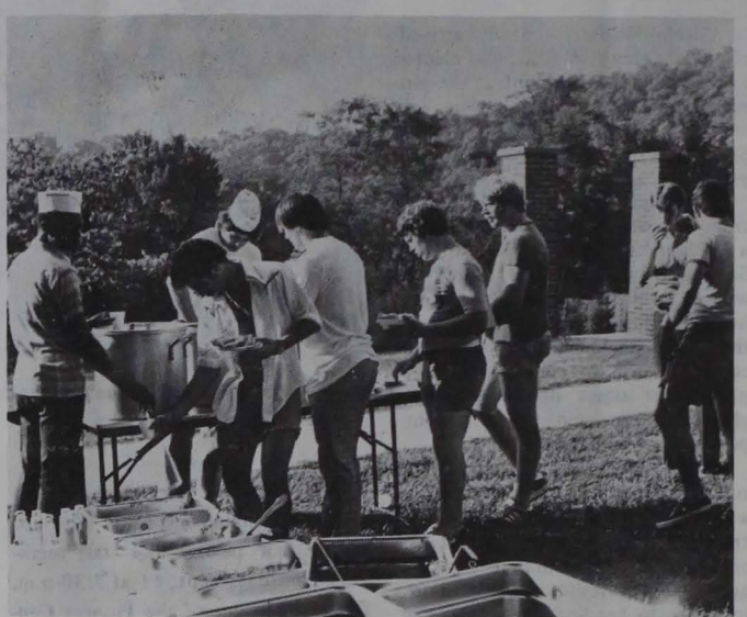
Students stand in line for supper during Freshmen Week's picnic on Verona Maple Lawn, last Wednesday, August 27.

September 19, Friday ..... Last Day to Apply for Dec. Graduation October 6, Monday, 7 p.m. .... English Proficiency Examination October 20, Monday ..... Mid-Semester October 23, Thursday ..... Mid-Semester D-F Grade Reports October 30, Thursday ..... Last Day to Withdraw with "W" November 25, Tuesday, 5 p.m. .... Thanksgiving Recess Begins December 1, Monday, 8 a.m. .... Thanksgiving Recess Ends December 8, Monday, 7 a.m. .... English Proficiency Examination December 19, Friday, 5 p.m. .... End of Semester