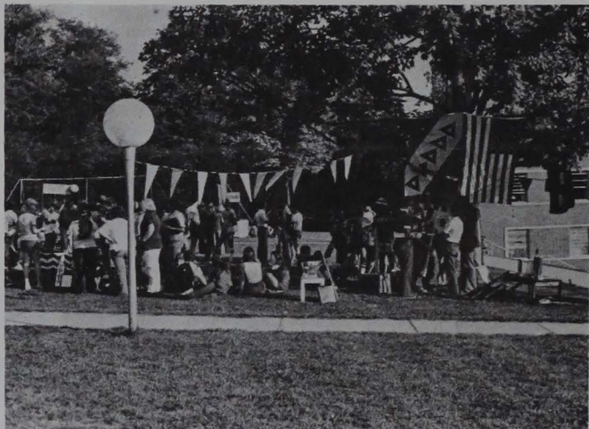
Exhibits on display last Wednesday, August 27th, during the CARNIVAL: "Organizations on Campus" orientation.

The report described affirmative action programs as beset with too many regulations and guidelines -- sometimes inconsistent with each other, too many agencies duplicating, and even feuding with, each other; too small, and sometimes unqualified, staffs; and overlong delays in processing plans and complaints.