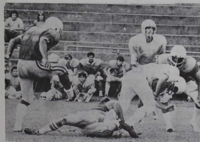
Hey there !!! Watch where you are stepping !!!

There will be a meeting of all organizations (frats, staff, independents) interested in men's intramurals in Room 209H Monday, Sept. 15 at 7:00 p.m. The purpose of the meeting is to establish an intramural board. It is important that all representatives be present.